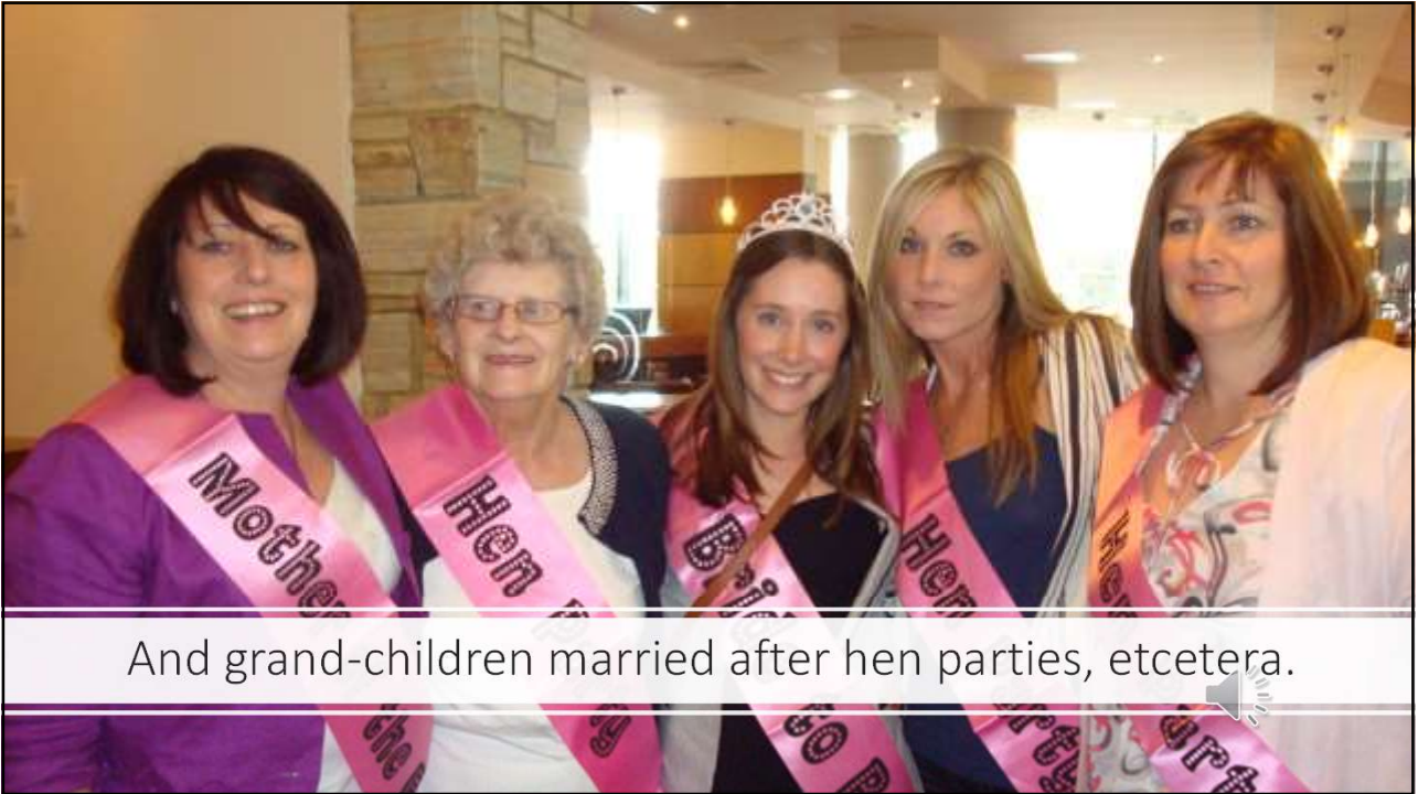
And grand-children married after hen parties, etcetera.