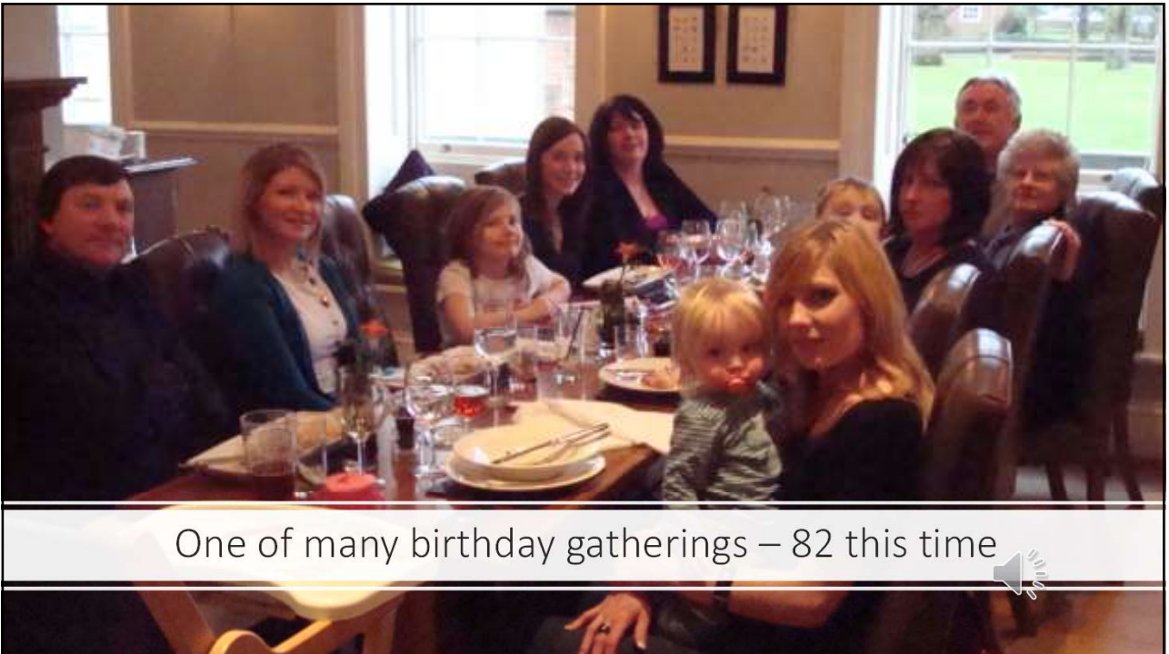
One of many birthday gatherings – 82 this time