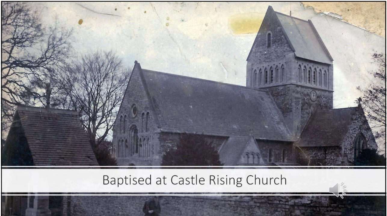
Baptised at Castle Rising Church